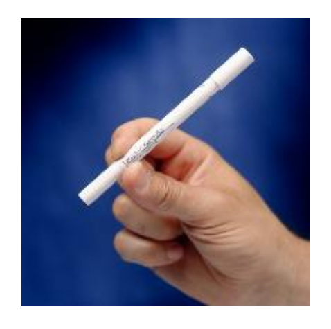
2. Crush the bottom ampule containing the solution vehicle by applying finger pressure to Position A on the cardboard sleeve.