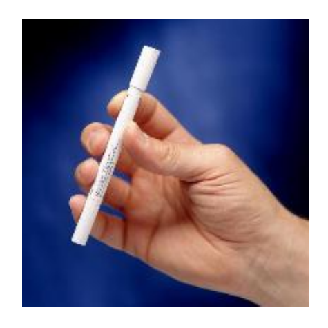
1. Hold the LEVULAN KERASTICK so that the applicator cap is pointing up.

The LEVULAN KERASTICK Topical Solution should be prepared as follows: