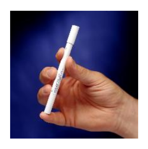
3. Crush the top ampule containing the ALA HCl powder by applying finger pressure to Position B on the cardboard sleeve. NOTE: To ensure both ampules are crushed continue crushing the applicator downward, applying finger pressure to Position A.

4. Holding the LEVULAN KERASTICK between the thumb and forefinger, point the applicator cap away from the face, shake the LEVULAN KERASTICK gently for at least 3 minutes to completely dissolve the drug powder in the solution vehicle. Do not press on the end cap while shaking.