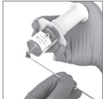
Fig. 2 Deliver Ultracare from the large, no-waste IndiSpense syringe to cotton applicator, cotton roll, etc., for placement.