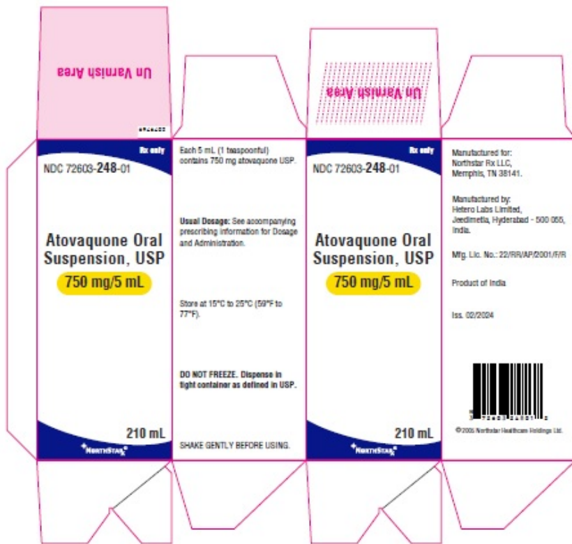
Atovaquone Oral Suspension, USP 750 mg/5 mL Container Label