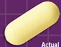
Actual Size PSEUDOEPHEDRINE FREE

Fever, Headache, Sore Throat, Coughing, Chest Congestion & Nasal Congestion