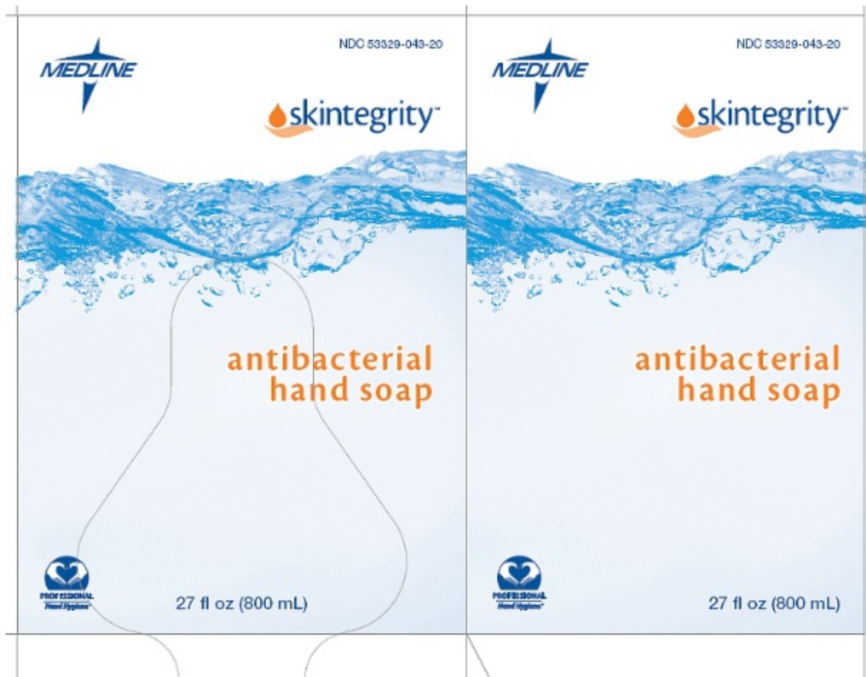
Skintegrity Antibacterial Hand Soap box, front and side