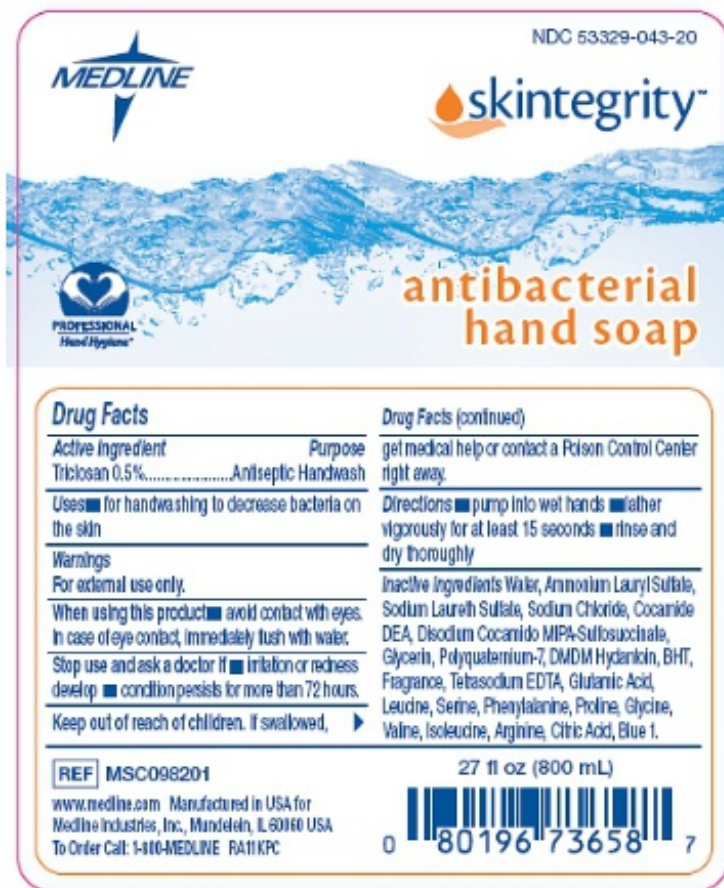
Skintegrity Antibacterial Hand Soap bag label