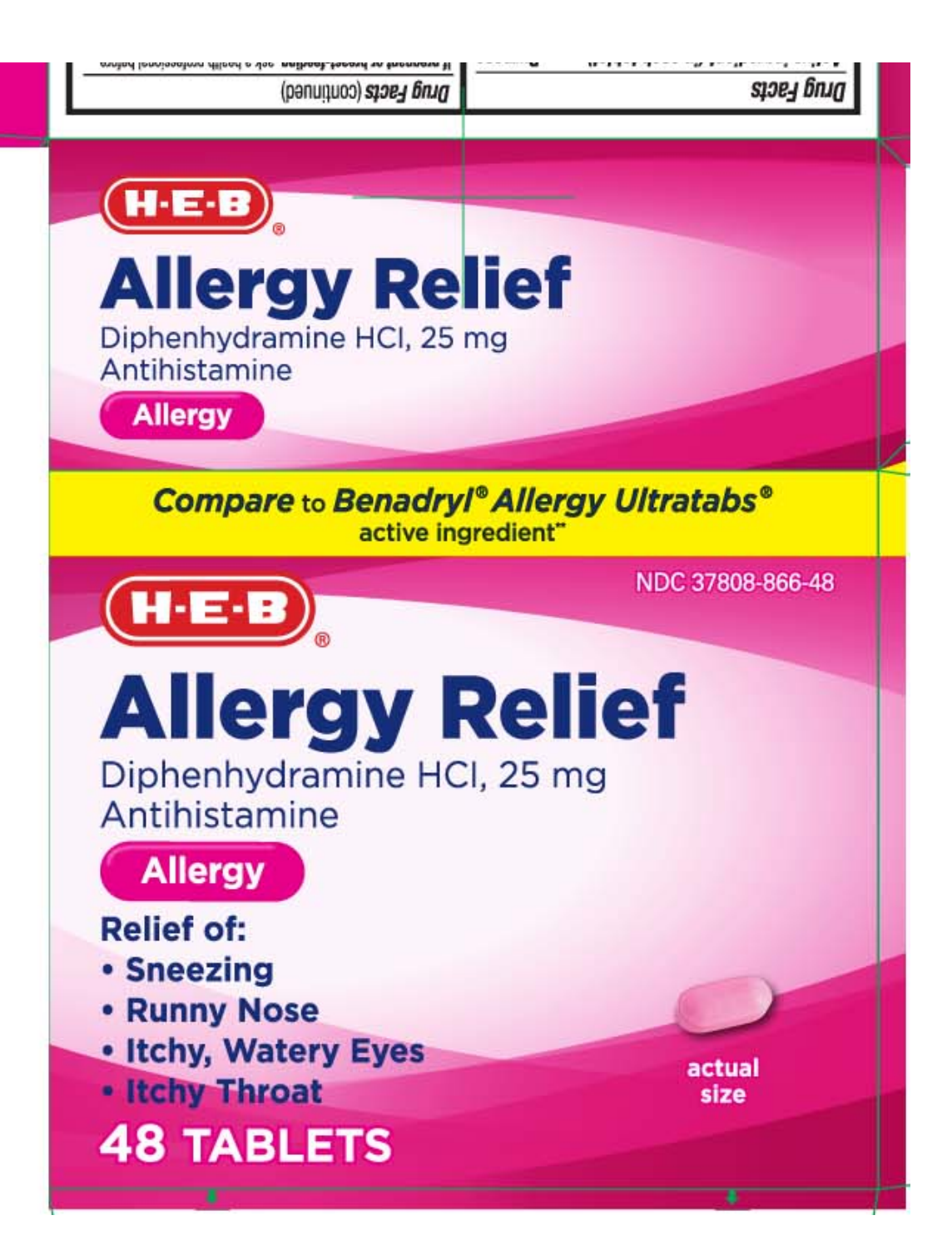
H-E-B Allergy Relief