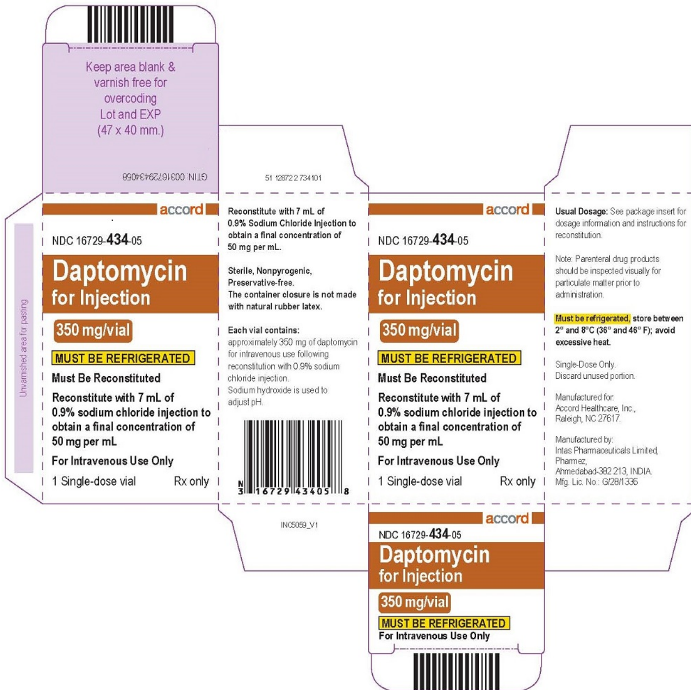
PACKAGE LABEL - PRINCIPAL DISPLAY PANEL - 10 Single-Dose Vials - Carton Label