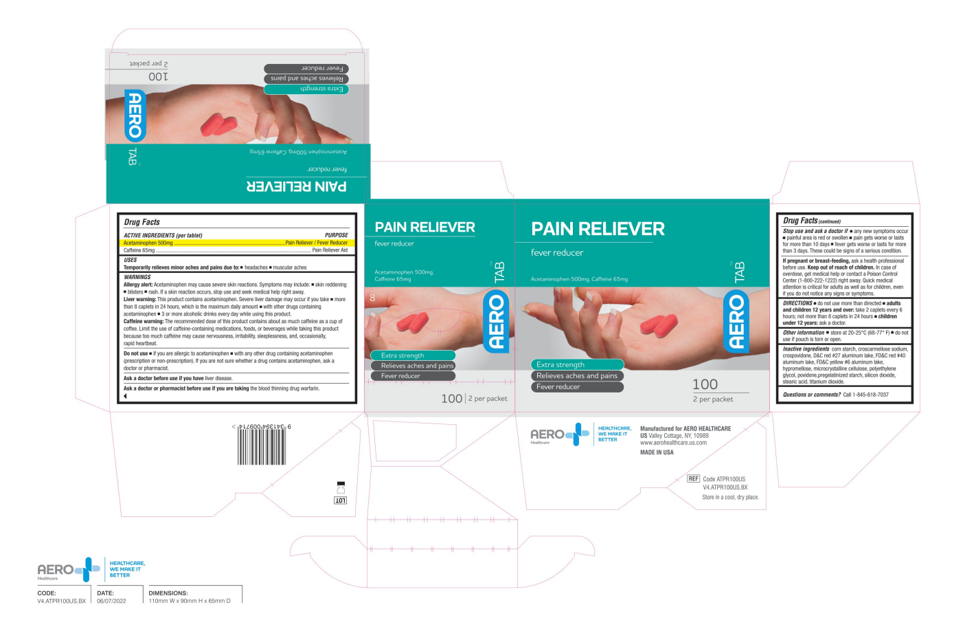
AERO HEALTHCARE – US PACKAGING PROGRAM BATCH 1 | PART THREE (REVISIONS)