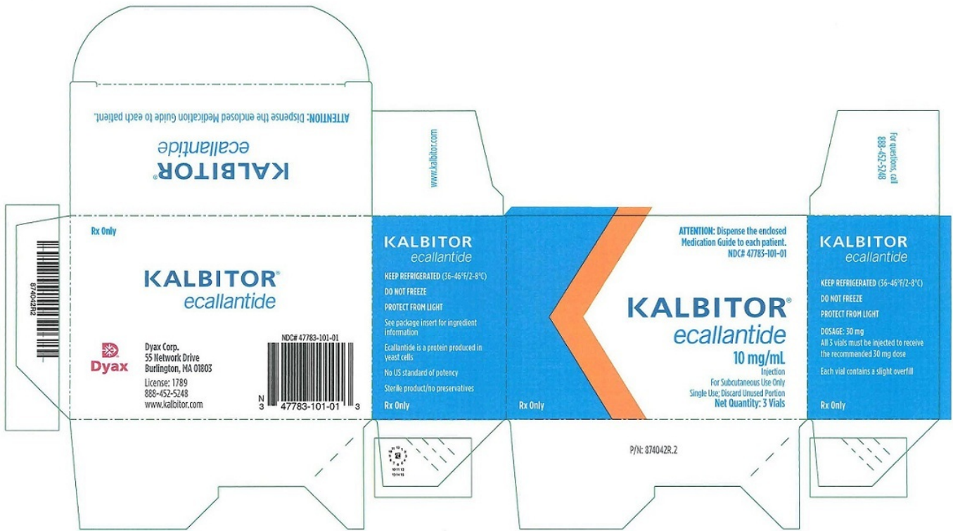
Kalbitor ecallantide 10 mg/mL Label