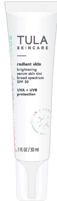
VISUAL ONLY take artwork from mech