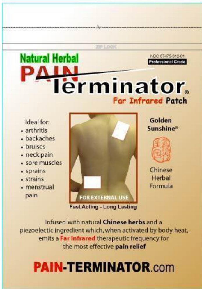
Pouch for 5 Patches - Front