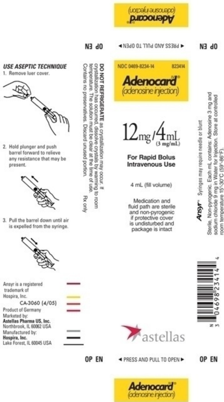
4 mL Syringe Carton