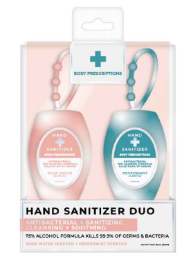
10315-6 (G1ABHS07) label