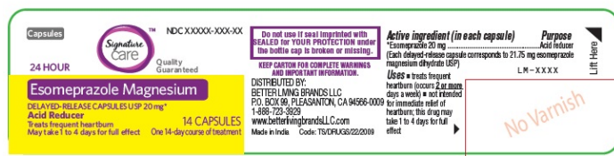
Top Ply (Page #1)