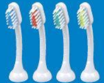
Adults: E2, E4

Emmi-dent Brush Heads are available in different sizes and colors. For optimum cleansing performance, replace the head every 3 months (brush heads not included in this box):