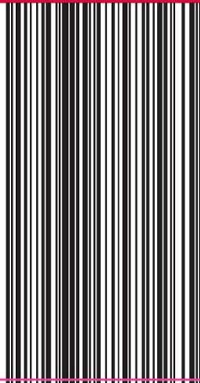
Children's Pain Relief Carton Image 2

*This product is not manufactured or distributed by McNeil Consumer Healthcare, distributor of Children's Tylenol® Oral Suspension. GLUTEN FREE DISTRIBUTED BY: AMERICAN SALES COMPANY 4201 WALDEN AVENUE, LANCASTER, NY 14086 www.care1.info ©2011 S&S Brands, Inc. Quality guaranteed or your money back.