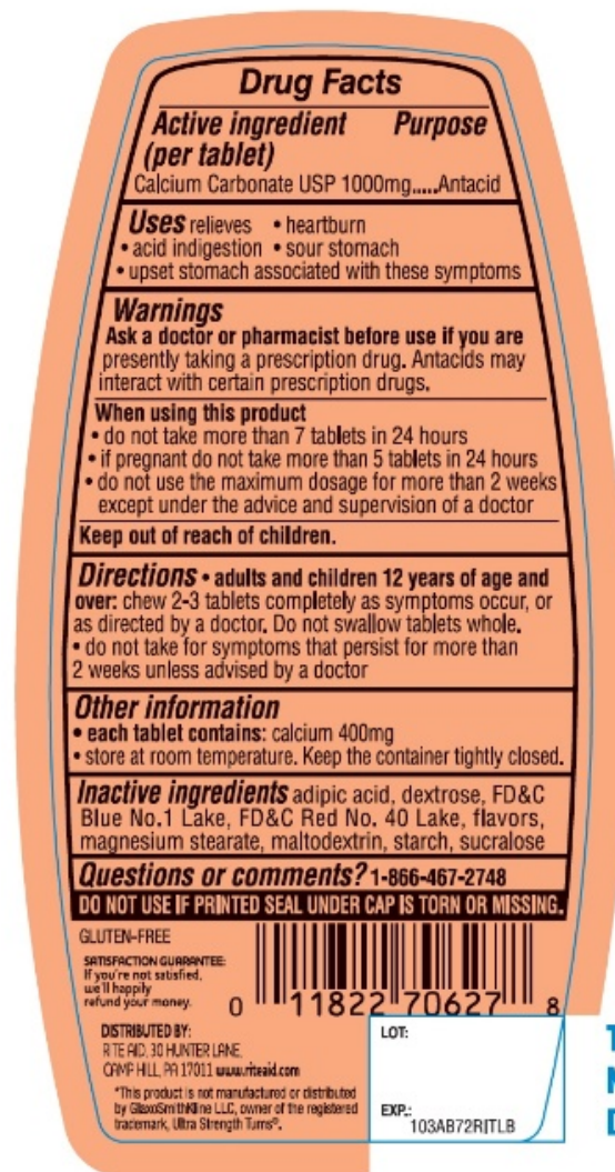
Ultra Strength 160 Chewable Label