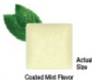
Actual Size Coated Mint Flavor