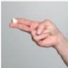
Figure F: Pick up a small amount of Clindamycin Phosphate Foam, 1% on your fingertips and gently rub into the affected area until the foam disappears.