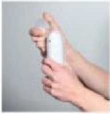
Figure A: Remove clear cap.