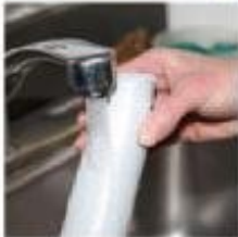
Figure E: If the can seems warm or the foam is runny, run the can under cold water.