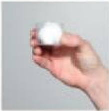
Figure D: Dispense enough Clindamycin Phosphate Foam, 1% to cover affected area.