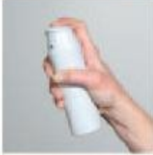
Figure B: Hold can upright and press nozzle firmly to dispense.