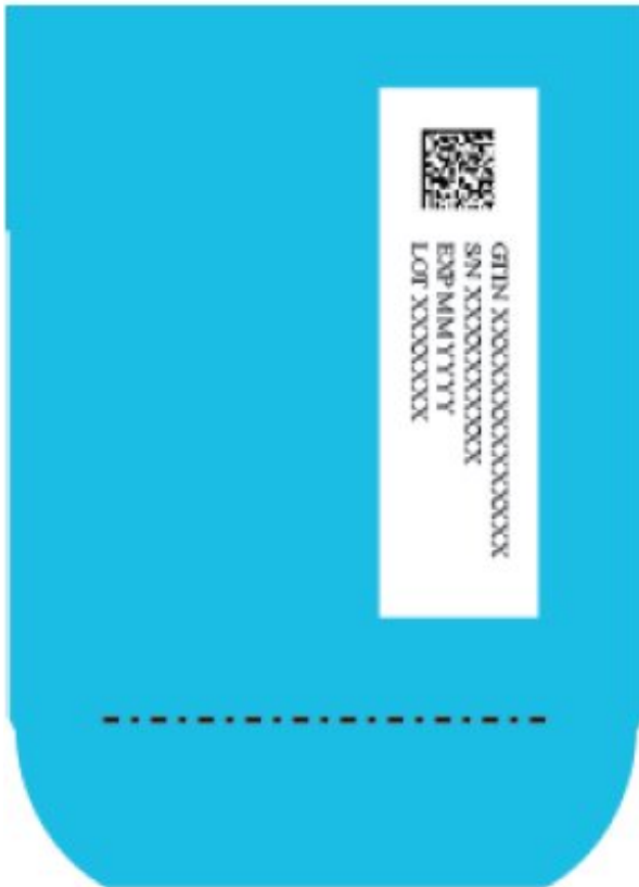
PRINCIPAL DISPLAY PANEL - 5 mg NDC 51079-632-20