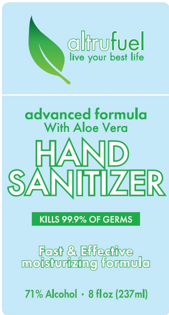
FRONT CLEAR GROUND