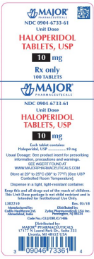
Package/Label Display Panel