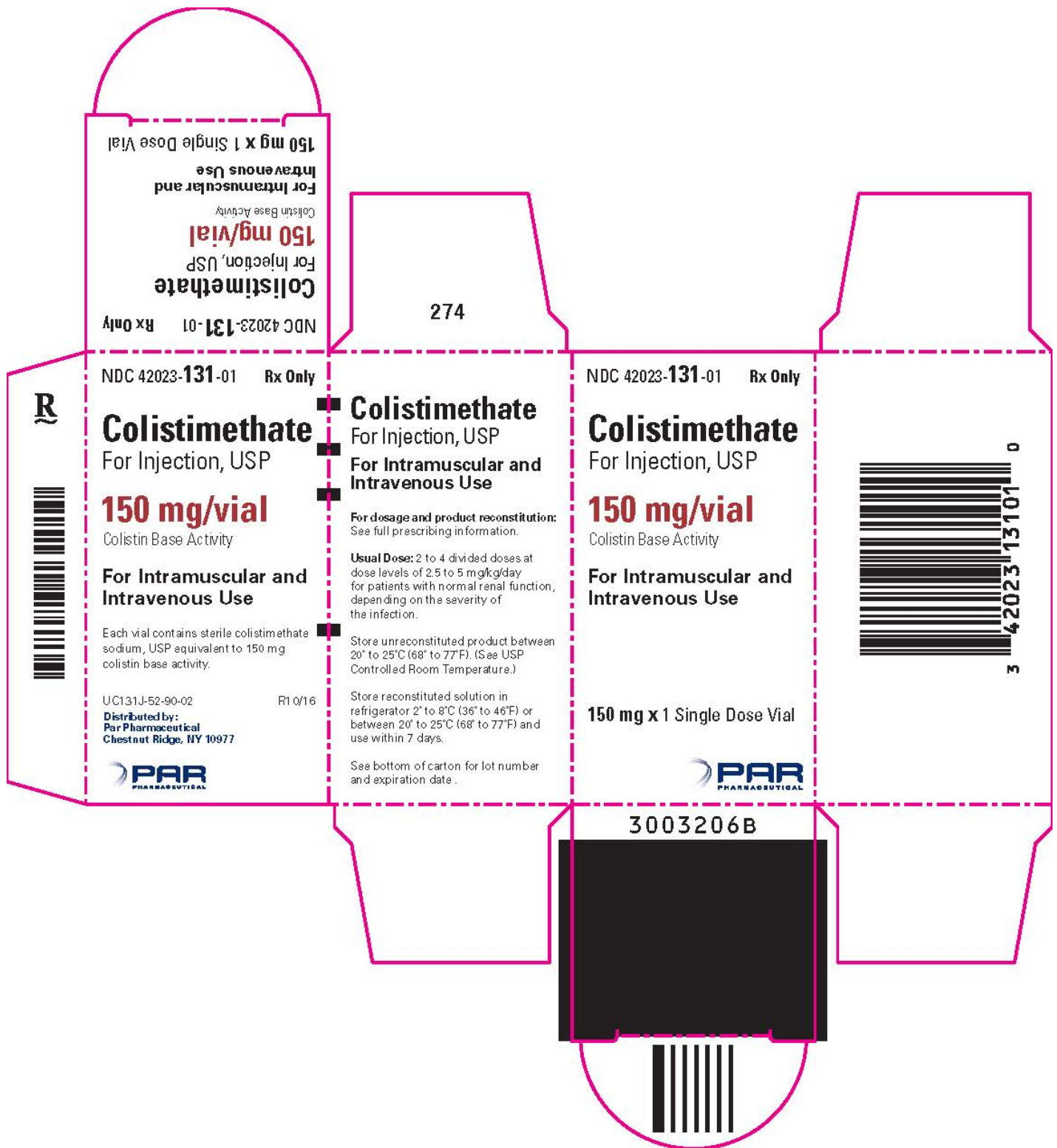
Colistimethate Single Pack Carton