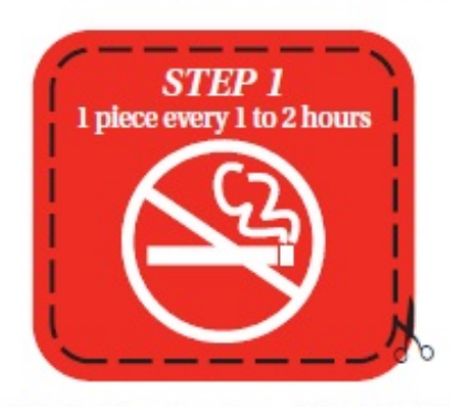
At the Beginning of Week #1 (Quit Date)