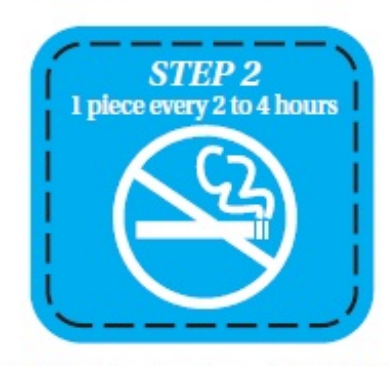
At the Beginning of Week #7