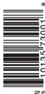
200 mg bottle label

Manufactured for and Distributed by: Marlex Pharmaceuticals, Inc. New Castle, DE 19720 Rev. 01/22 LAN