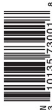
200 mg bottle label

Manufactured for and Distributed by: Marlex Pharmaceuticals, Inc. New Castle, DE 19720 Rev. 01/22 LAN