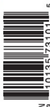
250 mg bottle label

Manufactured for and Distributed by: Marlex Pharmaceuticals, Inc. New Castle, DE 19720 Rev. 01/22 LAN