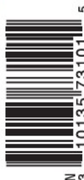
250 mg bottle label

Manufactured for and Distributed by: Marlex Pharmaceuticals, Inc. New Castle, DE 19720 Rev. 01/22 LAN