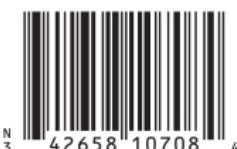
Pravastatin Sodium Tablets, USP 80 mg 1000s Label Text