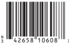
Pravastatin Sodium Tablets, USP 40 mg 1000s Label Text