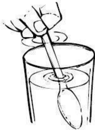
Figure 2. Mix dose in beverage or infant formula.

It is recommended that approximately half of your dosage be taken at the beginning of each meal or snack and the remainder of your dosage be taken during the meal or snack.