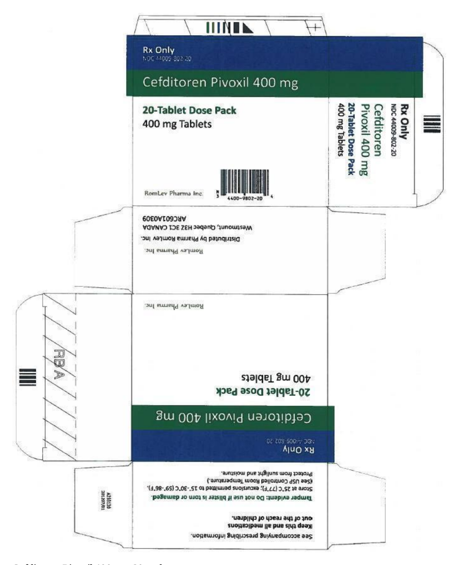
Cefditoren Pivoxil 400mg- 20pack