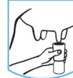
Teat Dip Baño de tetina

Lea la otra etiqueta para direcciones de uso, primeros auxilios y medidas preventivas