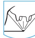
Teat Spray Roceador de tetina