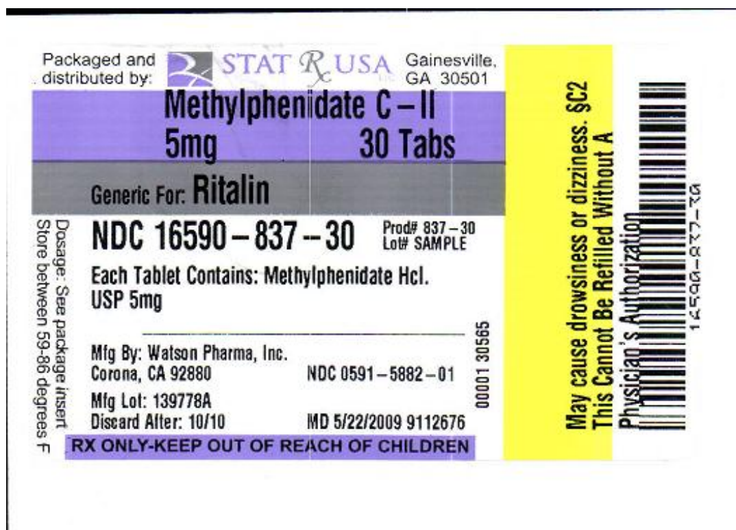
METHYLPHENIDATE 5MG LABEL IMAGE

Methylphenidate hydrochloride USP, is a mild central nervous system (CNS) stimulant, available as tablets of 5, 10, and 20 mg for oral administration. Methylphenidate hydrochloride is methyl \alpha -phenyl-2-piperidineacetate hydrochloride, and its structural formula is