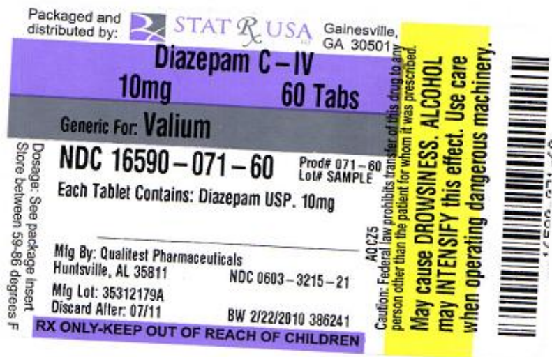
DIAZEPAM 10MG LABEL