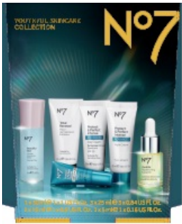
carton image 3