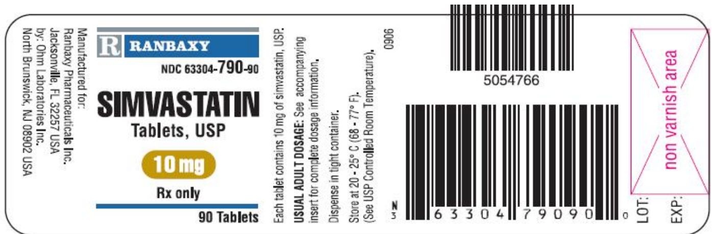
90's bottle label

RANBAXY NDC 63304-790-90 SIMVASTATIN Tablets, USP 10 mg 90 Tablets Rx only