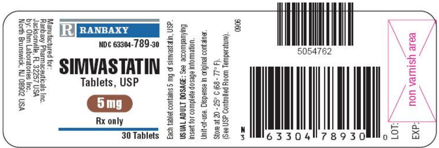
30's bottle label

RANBAXY NDC 63304-790-90 SIMVASTATIN Tablets, USP 10 mg 90 Tablets Rx only