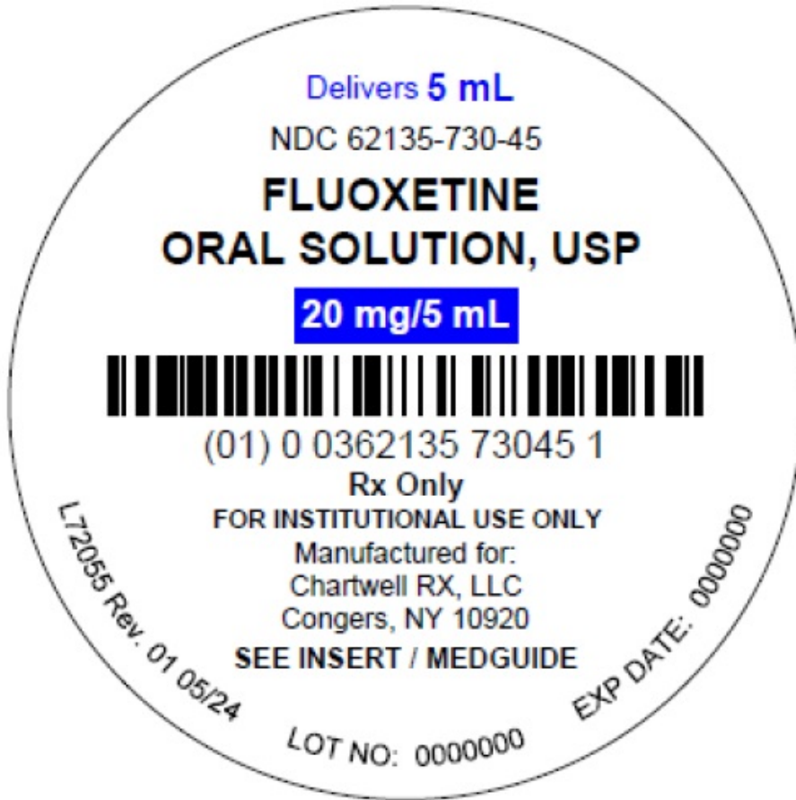
Fluoxetine Oral Solution, USP 20 mg/5 mL - NDC - 62135-730-45 - 5 mL - Unit Dose Label