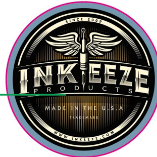
TOP OF LID