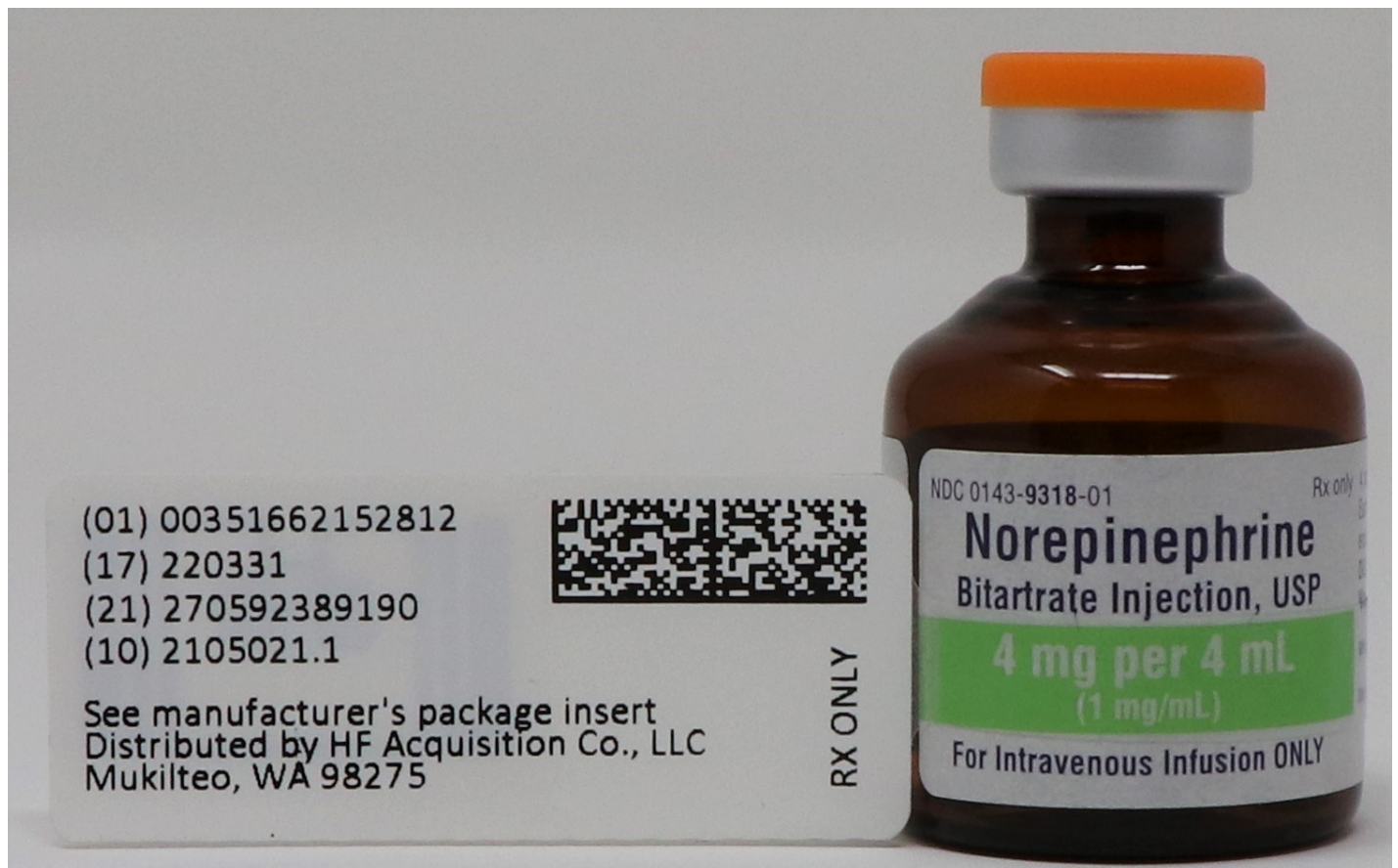
Principal Display Panel 51662-1528-2 Pouch