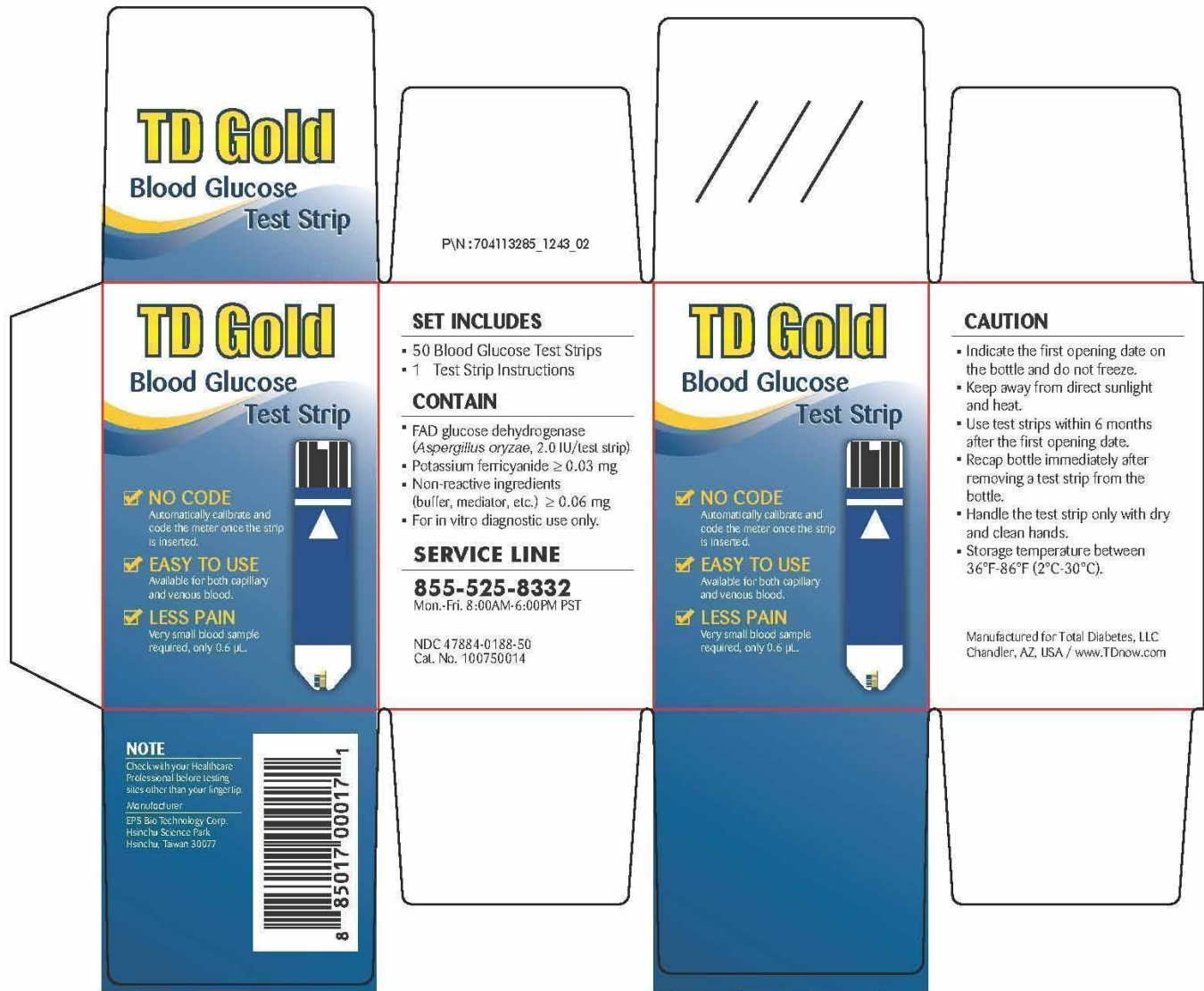
Diagram of TD Gold Blood Glucose Test Strip