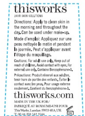
Left Panel label: 35mm W x 132mm H