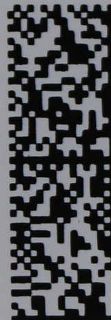
51662-1282-2 - POUCH LABELING