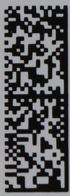
51662-1282-3 - BOX LABELING