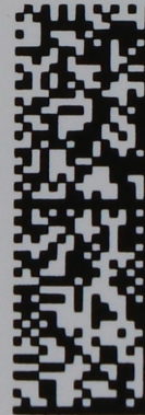
51662-1536-3, BOX LABELING