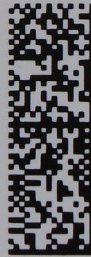
51662-1535-3, BOX LABELING