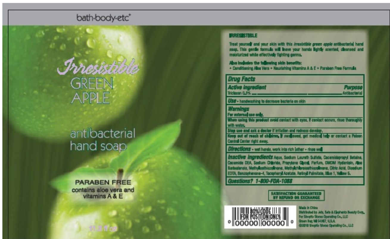
Irresistible Green Apple Bottle Label