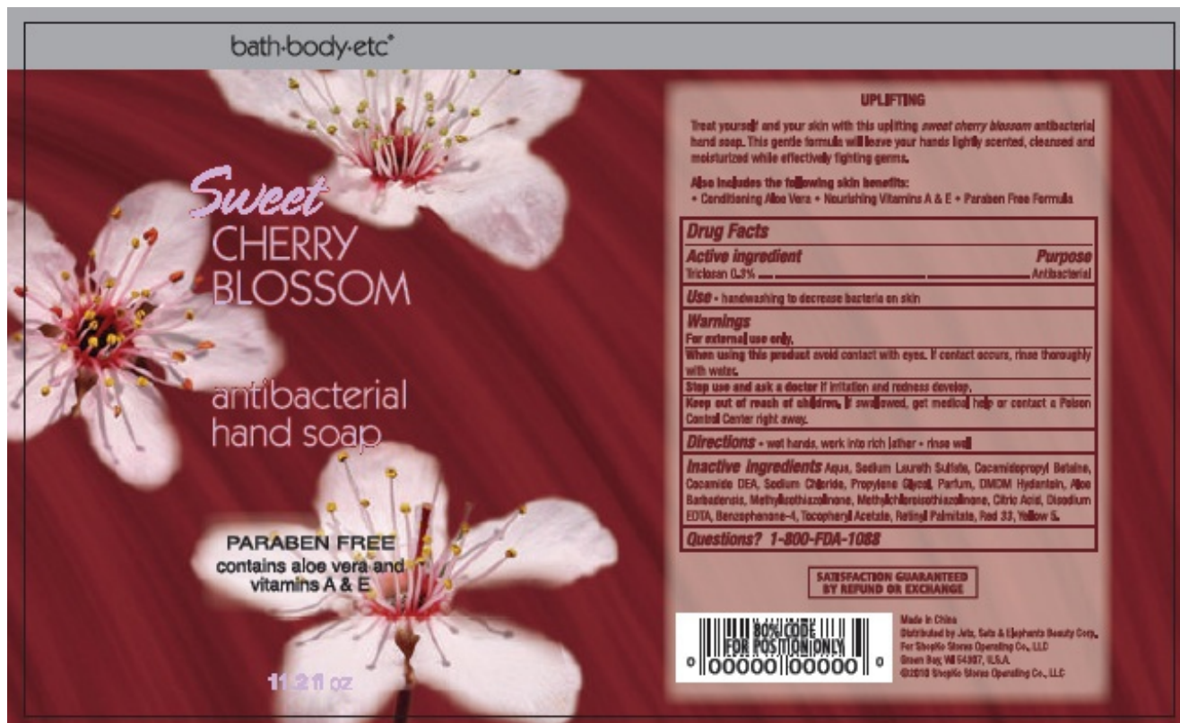
Sweet Cherry Blossom Bottle Label