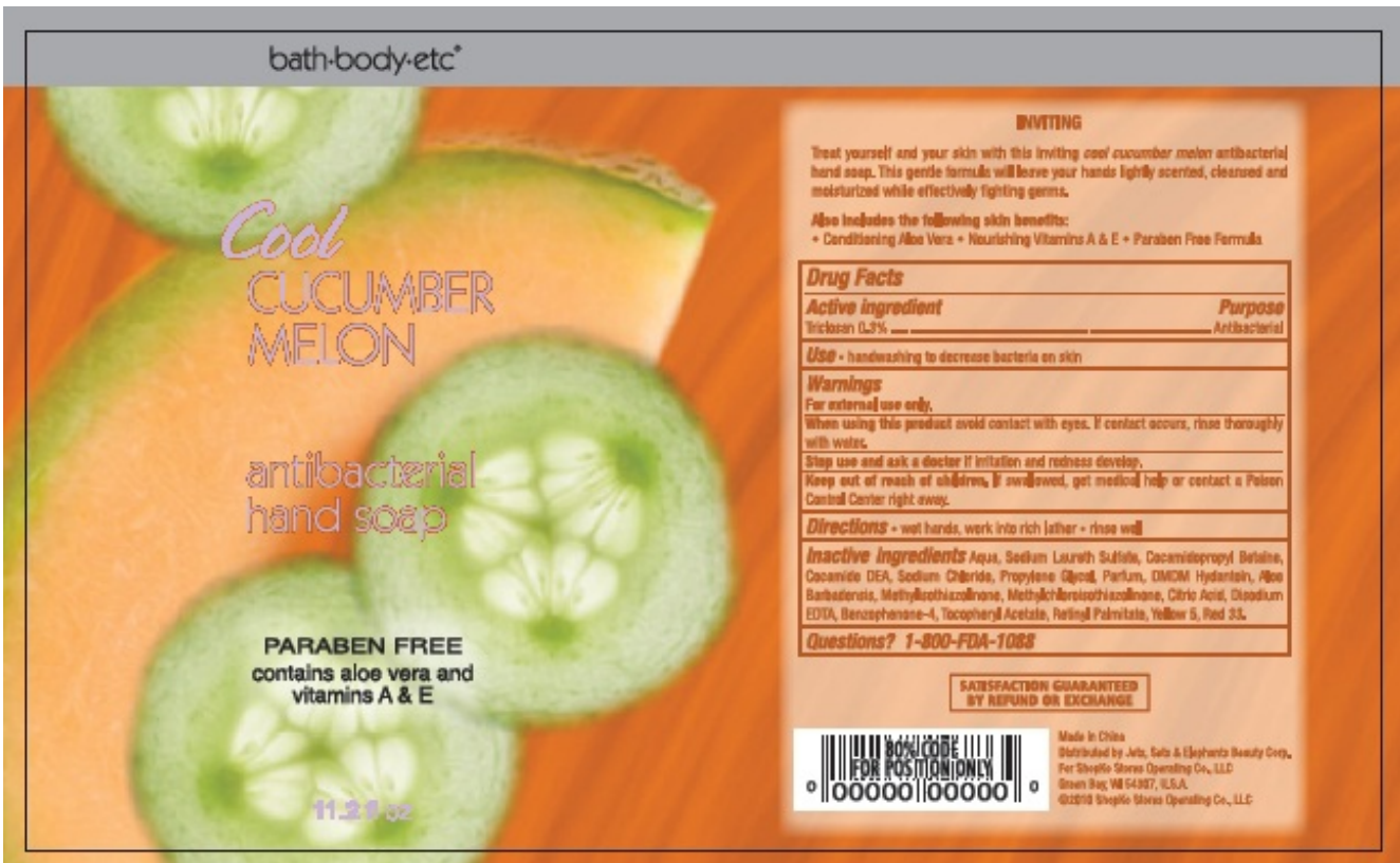
Cool Cucumber Melon Bottle Label