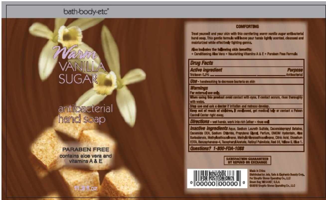
Warm Vanilla Sugar Bottle Label

PARABEN FREE contains aloe vera and vitamins A & E 11.2 fl oz