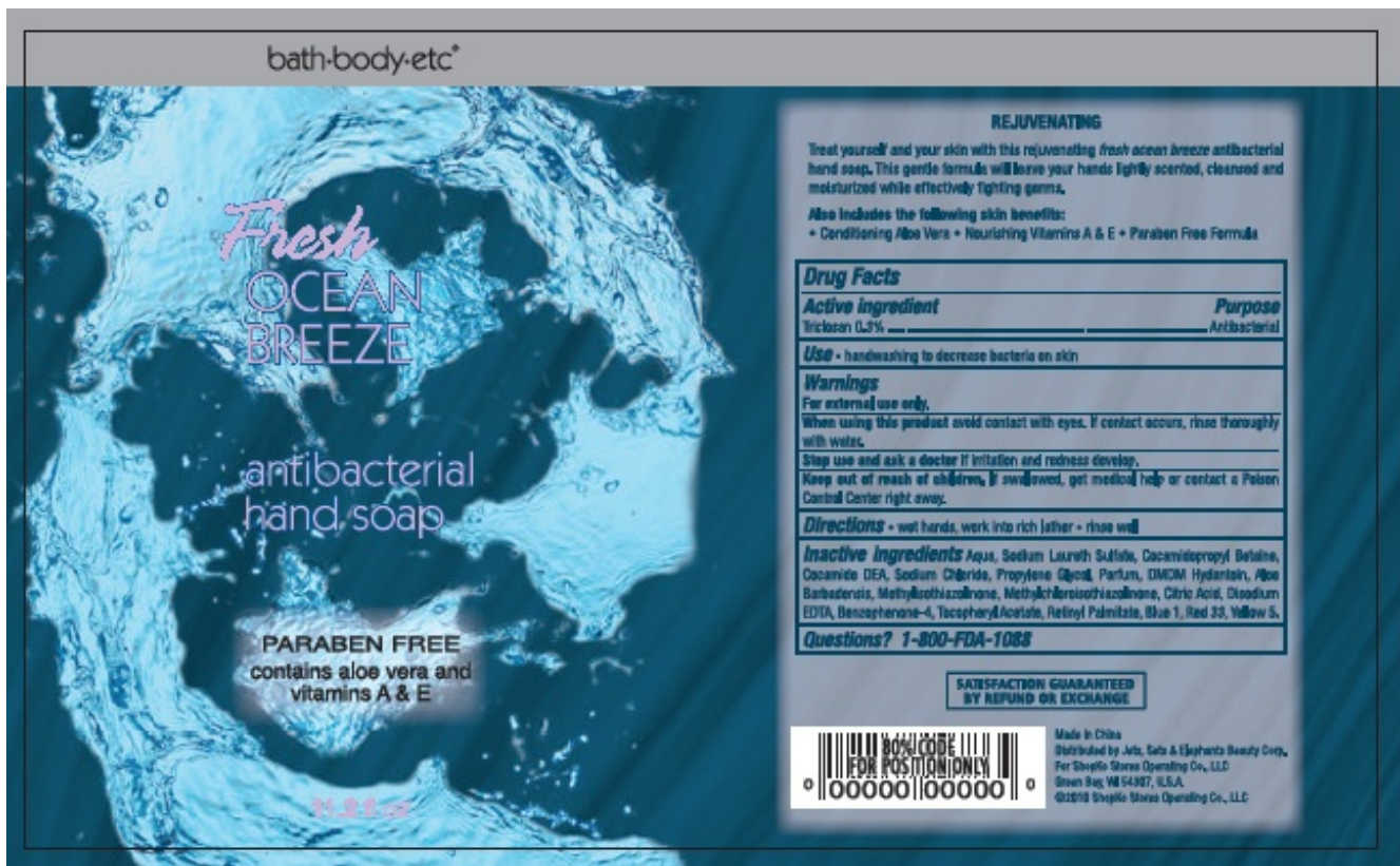
Fresh Ocean Breeze Bottle Label