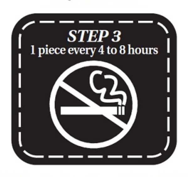
At the Beginning of Week #10