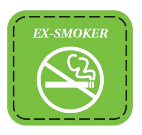
12 Weeks After Quit Date