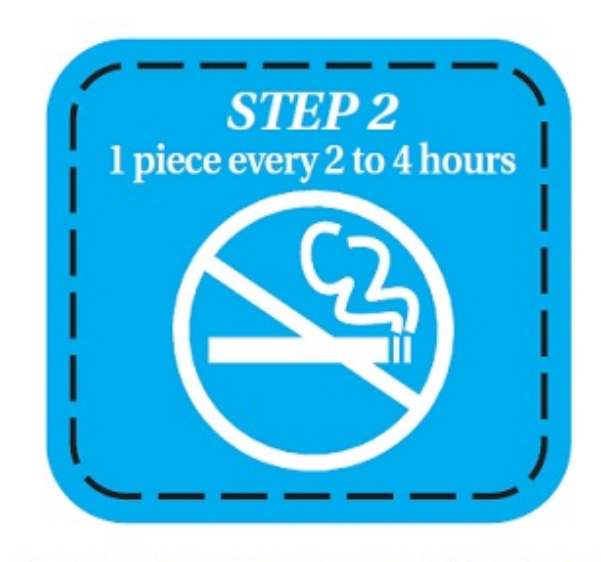
At the Beginning of Week #7