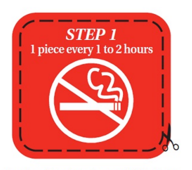
At the Beginning of Week #1 (Quit Date)