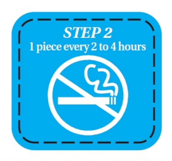
At the Beginning of Week #7