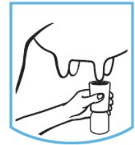
Teat Dip Baño de tetina

Read other label for directions for use, first aid and precautionary statements Lea la otra etiqueta para direcciones de uso, primeros auxilios y medidas preventivas