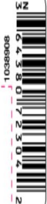
Calcitriol Capsules 0.25 mcg (30 s)