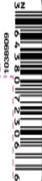
Calcitriol Capsules 0.25 mcg (100 s)