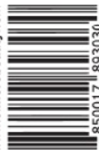
1750 mL Bottle