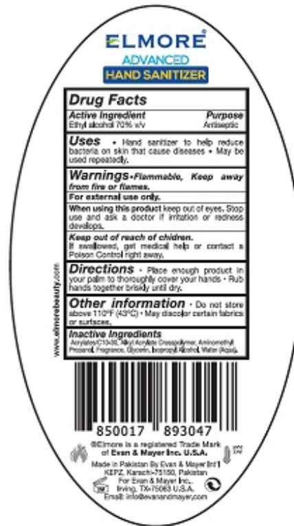
150 mL Bottle