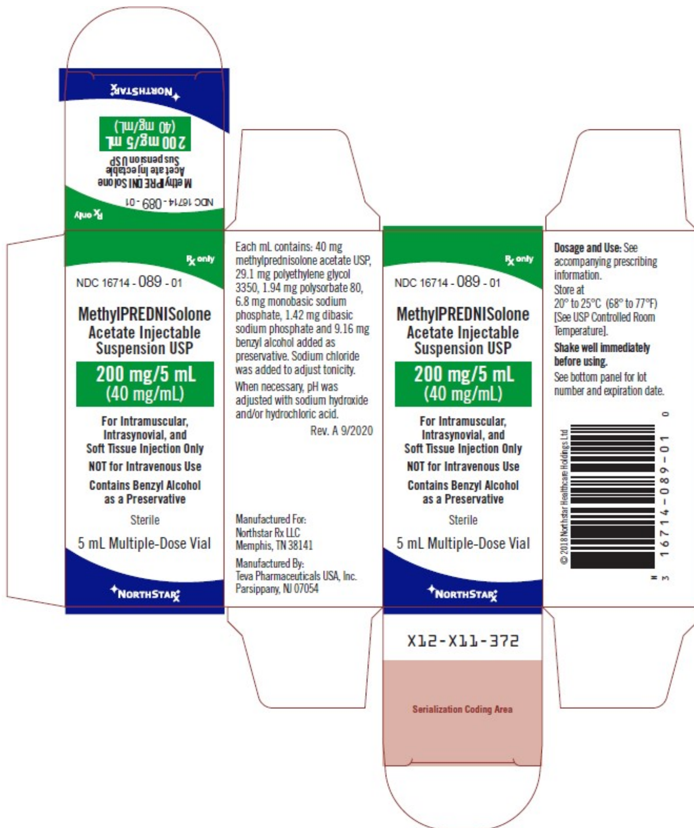
Package/Label Display Panel