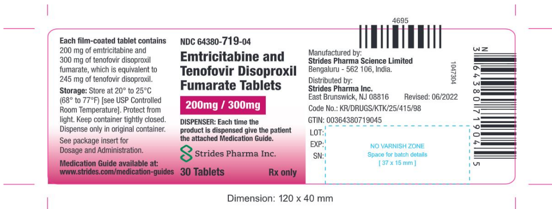
Dimension: 120 x 40 mm

give the patient the attached Medication Guide.