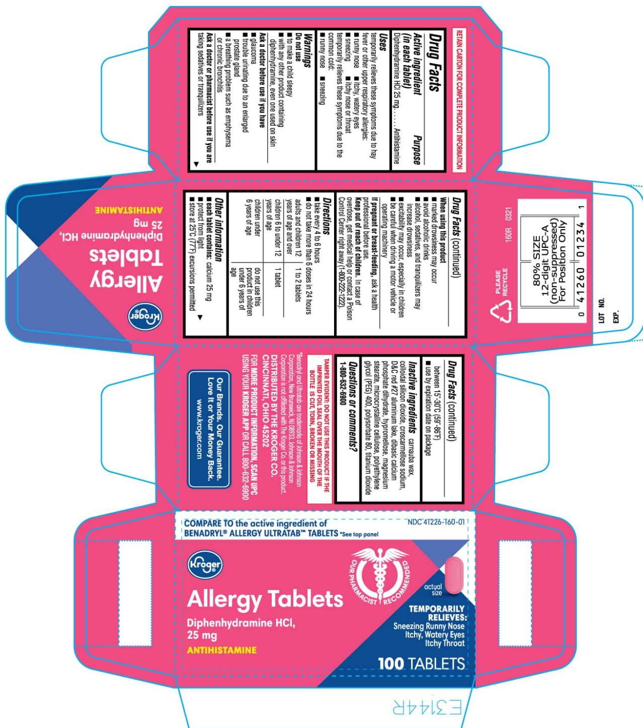
Allergy 100ct label